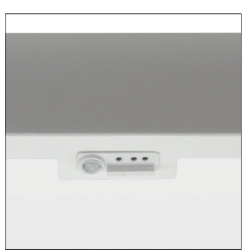
XC daylight&occ sensor

All current index numbers, lumen outputs, power consumption and many other technical information are available in our 2024 pricelist. Details on wireless lighting control systems on page number 896.