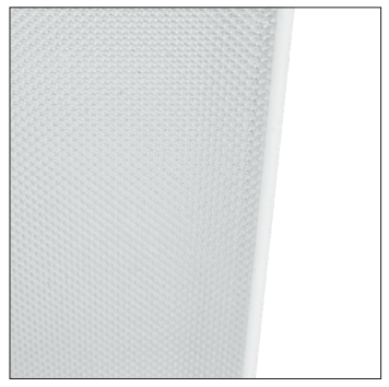
MP19H microprismatic diffusor